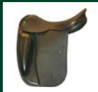
Close Contact Dressage