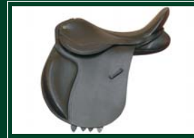
Flap B - Cross Country