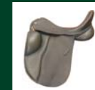
Olympian MkII Dressage