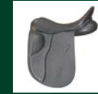
Orion MkII Dressage