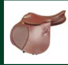
Junior Close Contact