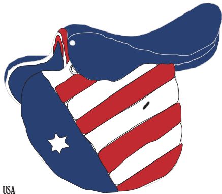
USA Trade Show Saddle