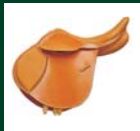
Capri Close Contact