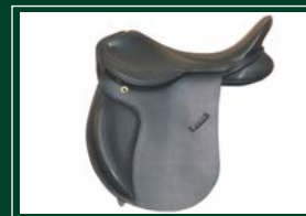
Flap C - Dressage