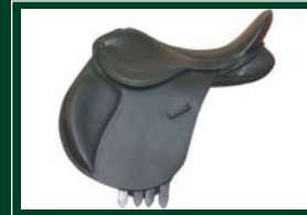
Flap A - Jumping