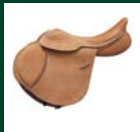
Capri Close Contact Delux