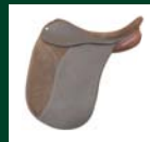
Trojan Working Hunter